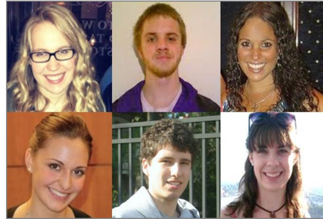
Have a great time with other reps