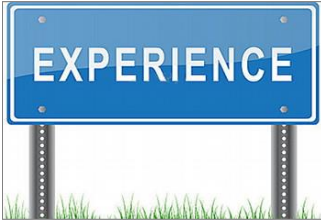
Develop skills and experience