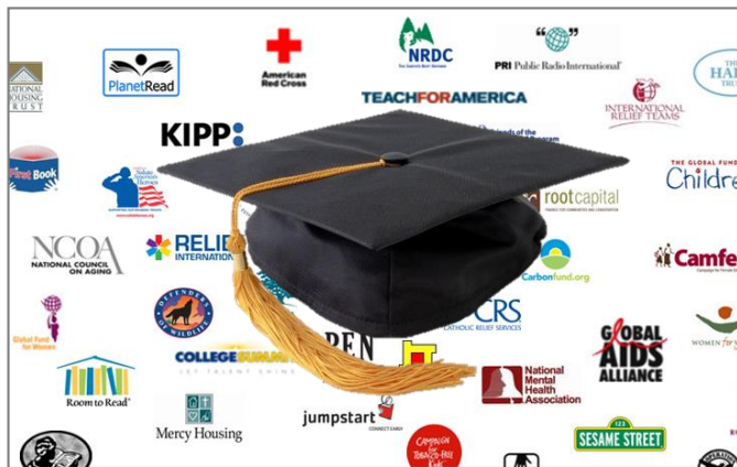
Make a difference by generating funds for schools and nonprofits – and for students’ tuition and textbooks